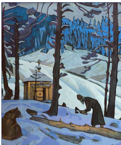
St. Sergius the Builder, c. 1923 By Nicholas Roerich