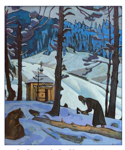
St. Sergius the Builder, c. 1923 By Nicholas Roerich