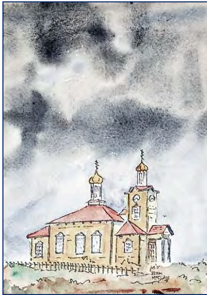
Sts Peter & Paul Church St Paul Island, Alaska, c. 1909